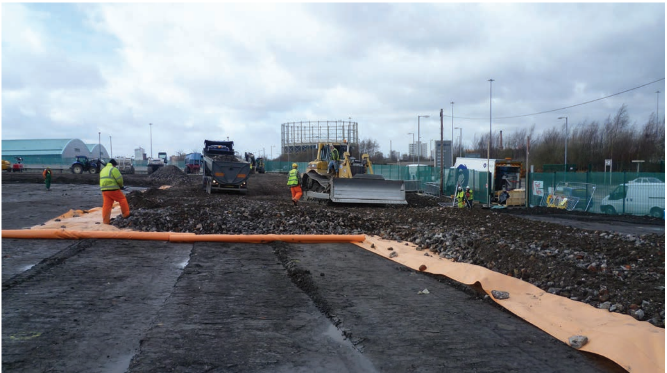
Hazard identification using Lotrak® Alarm 18

Highly visible, Lotrak® Alarm 18 has been specifically developed as a contaminated ground warning or marker barrier. Don & Low have drawn on their expertise and knowledge of this market sector and this combination of factors has resulted in the development of this multi-functional geotextile material. With increasing demand for good building land, reclamation of industrial zones is becoming more common place and potential hazards are now often buried and contained underground as an alternative to removal. Good environmental practice utilises Lotrak® Alarm 18 to notify future contractors and excavators of these hidden hazards.