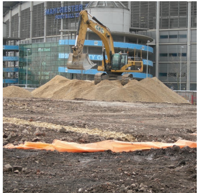
Installation of Lotrak® Alarm 18 at Manchester City Football Stadium